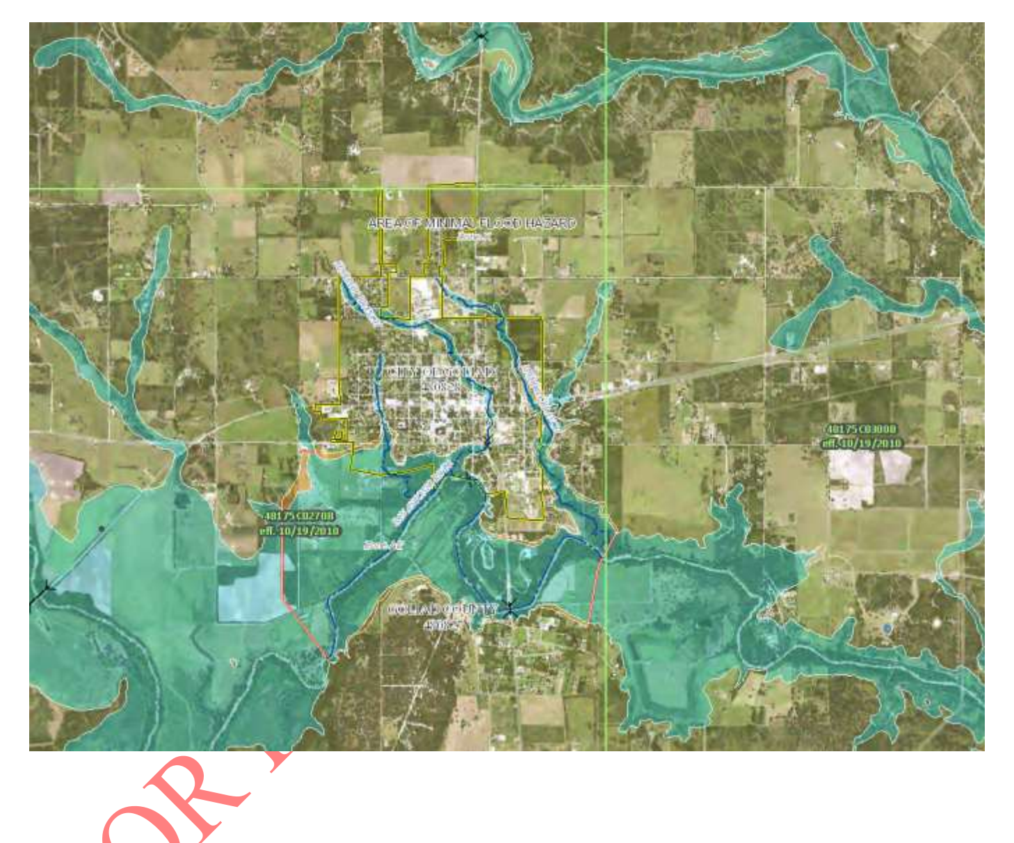
Exhibit A – Goliad City Flood Map