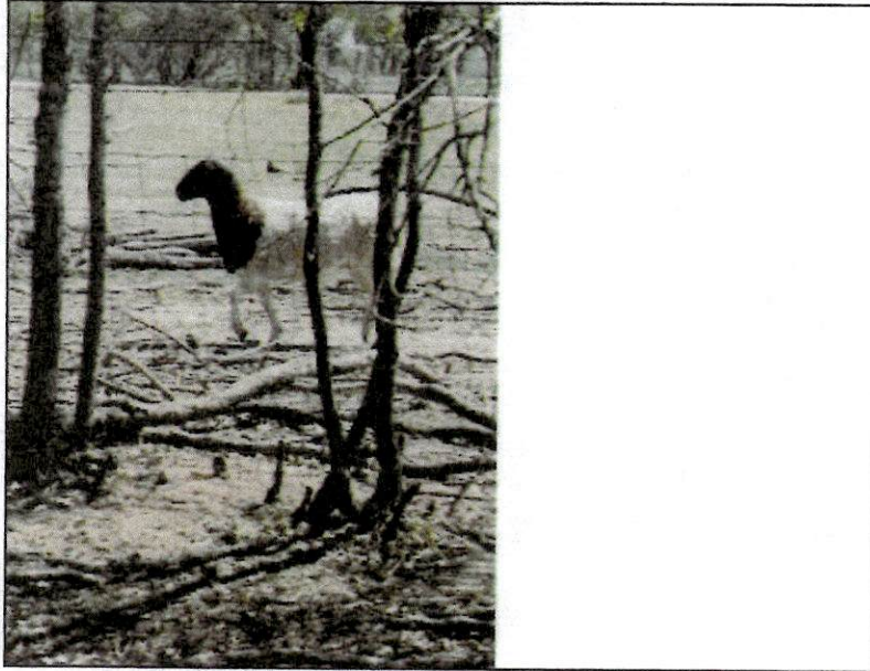
ESTRAY SHEEP (3).jpeg