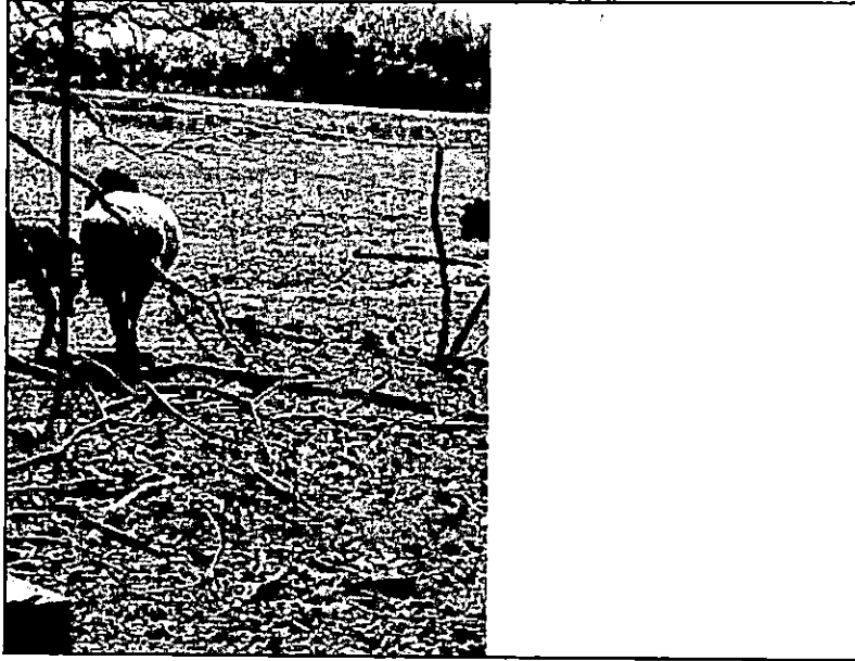
ESTRAY SHEEP (2).jpeg